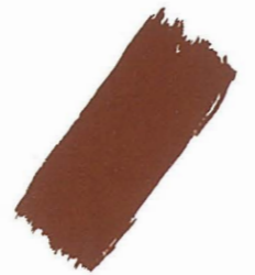
RED OXIDE PR101 / SERIES 2