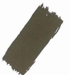
BONE BLACK (COOL) PBk9 / SERIES 1 (GOOD FOR TONAL RANGE)