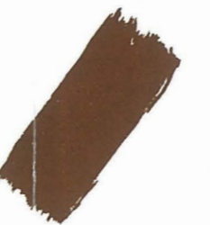
BURNT UMBER PBr7 / SERIES 2