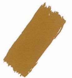
YELLOW OCHRE PY42 / SERIES 2