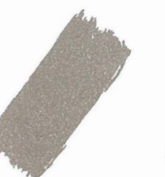
METALLIC SILVER SERIES 3