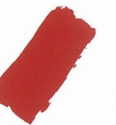
SCARLET RED PR112 / SERIES 4