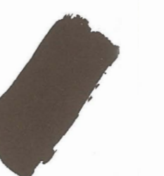
GRAPHITE PBk10 / SERIES 1