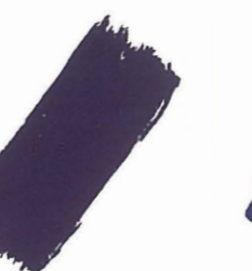
CARBAZOLE VIOLET PV23 / SERIES 4