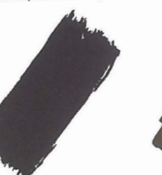
PAYNES GRAY PB29/PBk7 SERIES 1