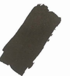
MARS BLACK (WARM) PBk11 / SERIES 1 FASTER DRYING