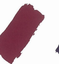
QUINACRIDONE MAGENTA PR122 / SERIES 4