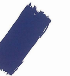
PHTHALO BLUE PB15:3 / SERIES 3