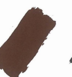
VANDYKE BROWN PR101/PBk7/PR112 SERIES 2