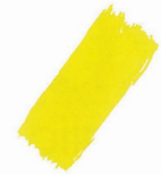
HANSA YELLOW PY74 / SERIES 3