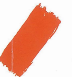
PYRROLE ORANGE PO73 / SERIES 4