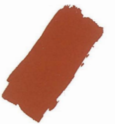
BURNT SIENNA PBr7 / SERIES 2