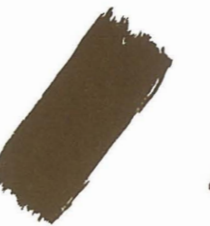
RAW UMBER PBr7 / SERIES 2