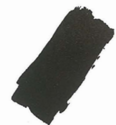
CARBON BLACK (WARM) PBk7 / SERIES 1 (STANDARD BLACK)