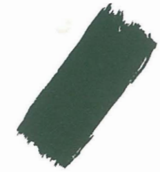
PHTHALO GREEN PG7 / SERIES 3