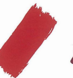
CRIMSON RED PR5 / SERIES 4