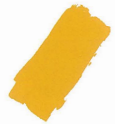
DIARYLIDE YELLOW PY83 / SERIES 4