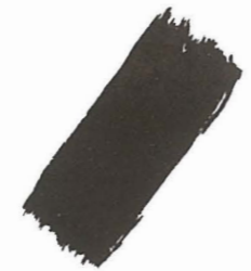
LAMP BLACK PBk7/PB15 / SERIES 1 (BLUE BLACK)