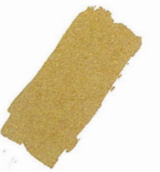
METALLIC GOLD SERIES 3