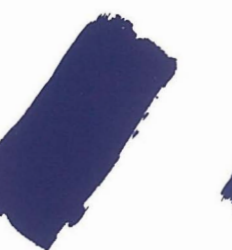
ULTRAMARINE BLUE PB29 / SERIES 3