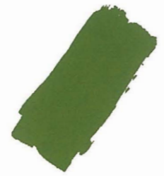
GREEN OXIDE PG17 / SERIES 2