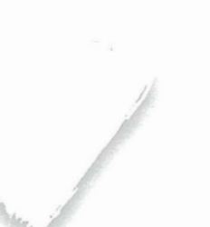
TITANIUM WHITE PW6 / SERIES 2 OPAQUE WHITE PW6 / SERIES 3