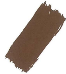
BURNT UMBER PBr7 / SERIES 2