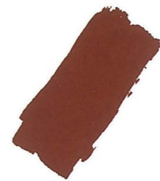
RED OXIDE PR101 / SERIES 2