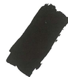
JET BLACK PBk7 / SERIES 1 (INTENSE)