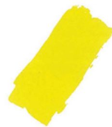
HANSA YELLOW PY74 / SERIES 3