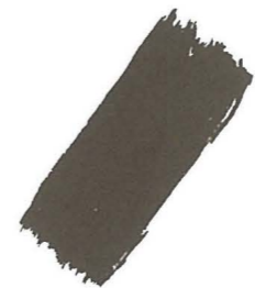
LAMP BLACK PBk7 / SERIES 1 (SEMI-TRANSPARENT)