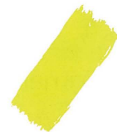
LEMON YELLOW PY3 / SERIES 2