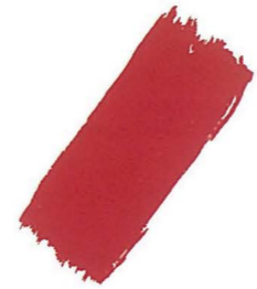
CRIMSON RED PR5 / SERIES 4