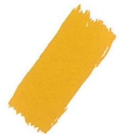
DIARYLIDE YELLOW PY83 / SERIES 4