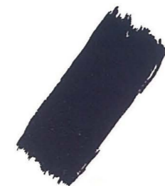
PHTHALO BLUE GREEN PB15:4 / SERIES 3