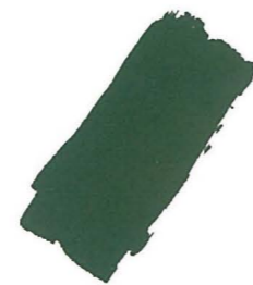
PHTHALO GREEN YELLOW PG36 / SERIES 3