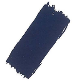
PHTHALO BLUE PB15:1 / SERIES 3