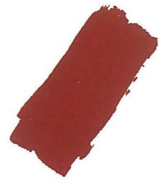
SCARLET RED PR112 / SERIES 4