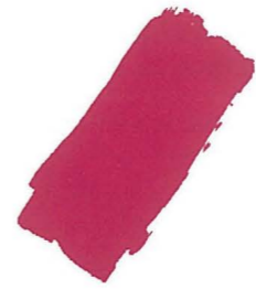
QUINACRIDONE RED PV19 / SERIES 4