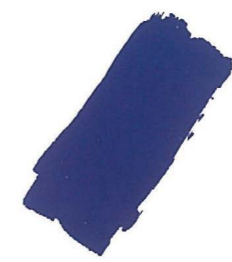
ULTRAMARINE BLUE PB29 / SERIES 3