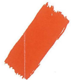
PYRROLE ORANGE PO73 / SERIES 4