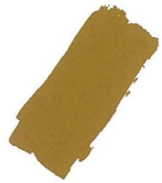
YELLOW OCHRE PY42 / SERIES 2