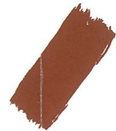
BURNT SIENNA PBr7 / SERIES 2