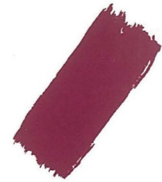
QUINACRIDONE VIOLET PV19 / SERIES 4