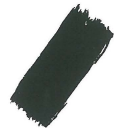
PHTHALO GREEN BLUE PG7 / SERIES 3