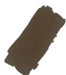
RAW UMBER PBr7 / SERIES 2